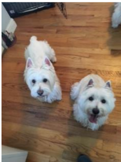
Jackie and Mattie

Hi we are Jackie and Mattie we are 9 and 11 years old. Our mommy died. She had been sick for a while. The family put us in a kennel where we stayed until Westie rescue said they would take us. We were very anxious and sick when they got us. But, after a few weeks in our new home with our new family and dogtors visits we feel much better now and are very happy. We have been adopted.