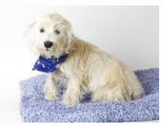
It's me MacDuff

MacDuff - Hi I am a very happy boy and I am Happy to be here. I recently got sprung from doggy jail after 3 weeks there. I am getting treatment for my bad skin and ears. I am a Westie mix and a very sweet boy they say. I get along well with people and doggies too. I know I need a proper haircut but I will get one when I have been here a little longer. I will be available for my forever home soon. I like doggies and people too. I adjust quickly and like to sleep in people beds.