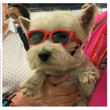
Finally, the best outcome was that over 1400 pets were adopted!

Thank you to all the volunteers and attendees that came by the booth. We hope to do it again next year.